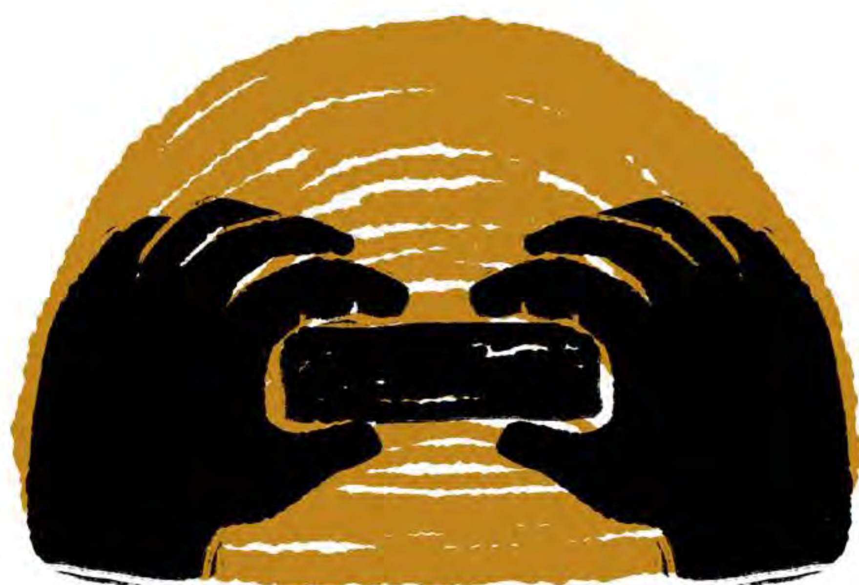
پژوهشکده معماری خاک اصفهک ESFAHK MUD CENTER

Please contact us by email and let us know if you are enthusiastic to accompany us in the workshop. Send us a brief motivation letter and your CV. If you may need any further information, don't hesitate to contact us.