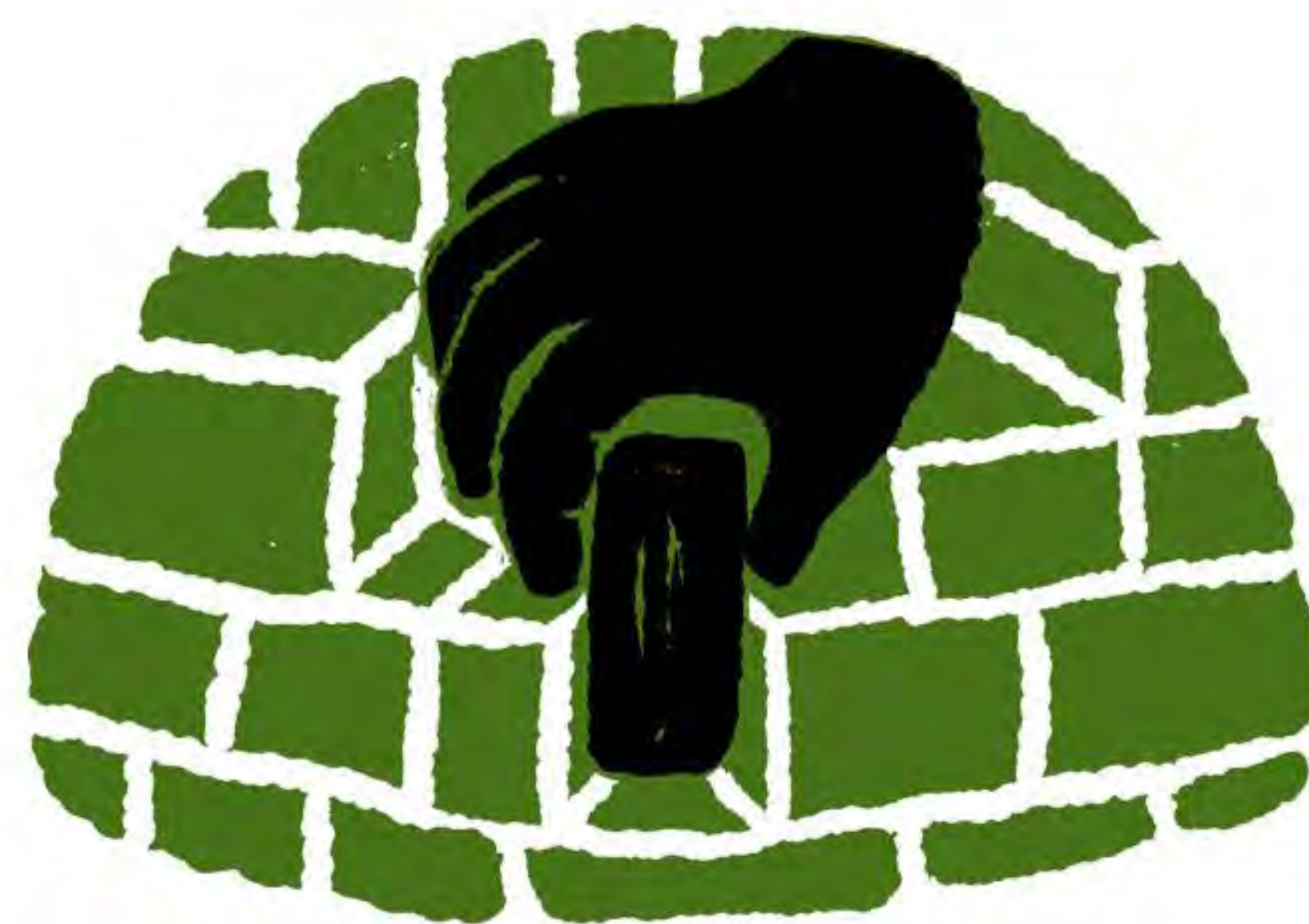
M O N A R G I L E

mud.esfahk@gmail.com www.mud-esfahk.org www.facebook.com/Mud.Esfahk www.instagram.com/mud.esfahk