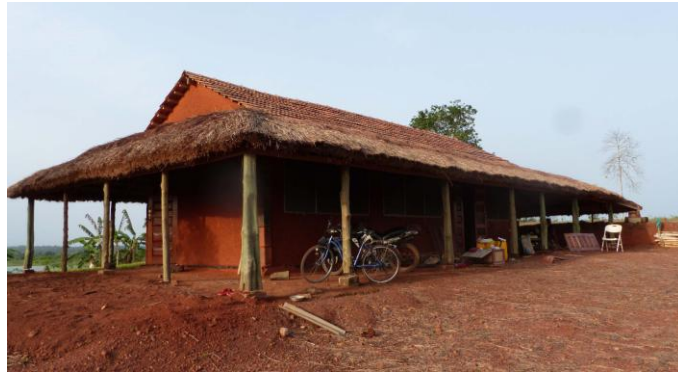
The venue: Lake Agege Farm with a view of the lake