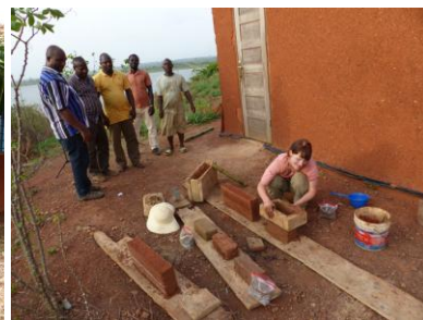
Previous earth building workshops on the premises of the Institute for Organic Farming and Earthbuilding